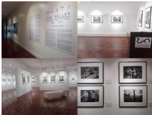
Figure 1. Photography Exhibit by Pierre de Vallombreuse at the Senate Hall of the National Museum of the Philippines

In order to achieve the purpose of this study, the researchers conducted an ocular investigation and documentary analysis of the photographed memorabilia (Figure 1) exhibited in the Senate Hall of the National Museum of the Philippines. It serves as the primary source of data and information to analyze and understand the unique ways of living of the Tau't Bato Tribe.