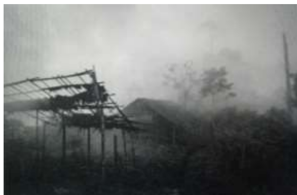
Figure 3. An abandoned hamlet and a Tau’t Bato house during a misty morning. (This photo was taken in 2015.)