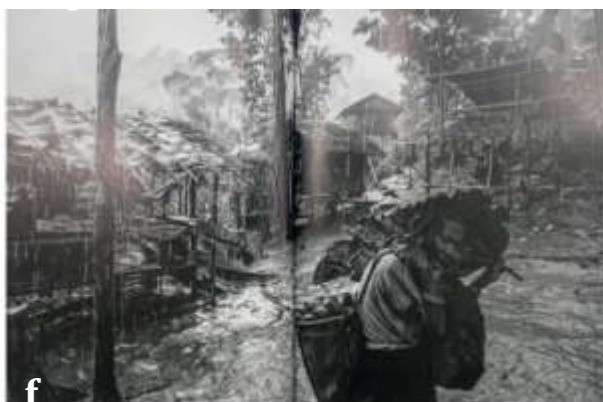
Figure 6 (a) Taking a short break during swiddling of the land; (b) A family farming the swiddled land with the aid of a carabao, 2017; (c) A man climbing a rock wall, 2017; (d) Men climbing the steep rock wall while hunting; (e) Children playing; (f) An old woman caught in heavy rain using a leaf as an umbrella.