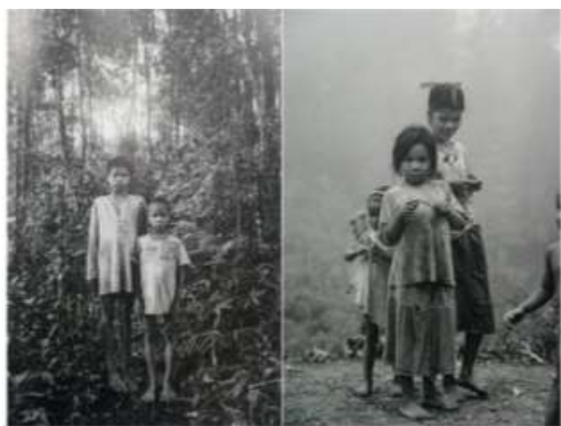
Figure 8. Children from Taaw't Bato tribe dressed in modern day clothes.

In rare occasions when researches visit the tribe, they witness how the people make fire by rubbing two stones together. When the natives were offered the use of modern lighters for easier production of fire, the people respectfully decline the offer opting to use their own method of building fires (Maentz, 2012) thus ensuring that they would not be dependent on things that