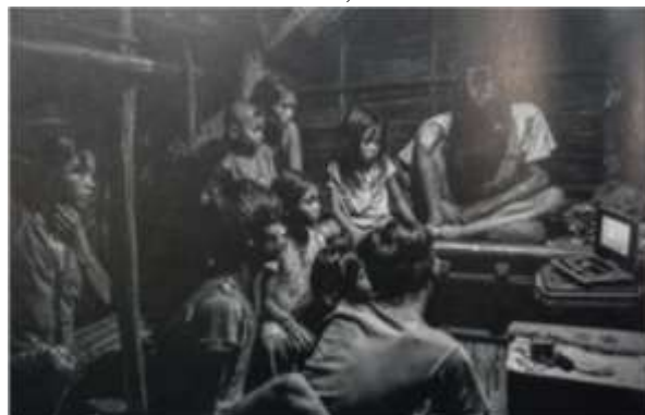
Figure 11. An evening of watching a movie from a DVD player, 2017.

members of the tribe. Harmony and balance between the natives and the nature is what they believe in, thus peace is always maintained. As such is the case, children are free to play without any worries from potential danger coming from the members of the tribe; women without tops carrying babies are also safe to cross rivers and hunt for fishes in the river, or visit other families