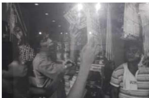
Figure 12. Buying a new DVD movie from a local market near the coast.