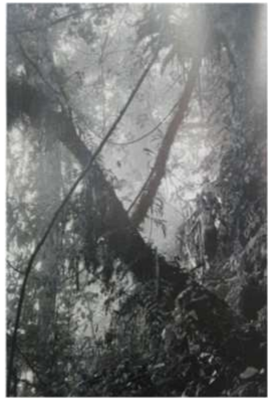
Figure 14. A family leaves the cave to live down the valley, 1994.

Years passed and owing to the comforts that had been presented to them, the native slowly began to yearn for more than what they possess in the valley. Their numbers began to dwindle as time goes on due to the migration of families (Figure 14) who preferred to stay near municipalities that provides health care and education for their children.