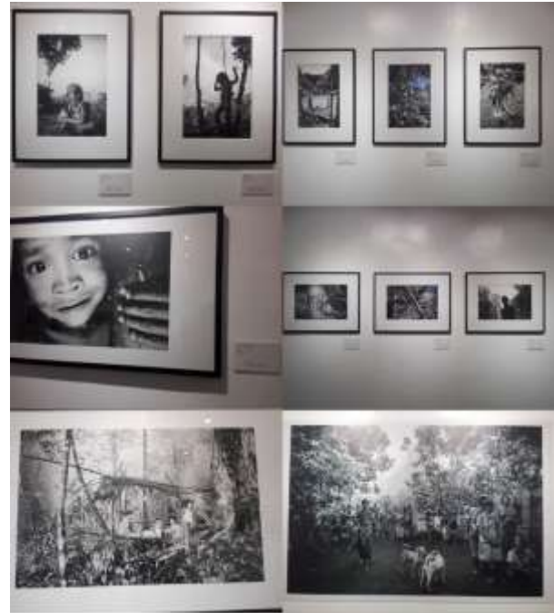
Figure 2. Sample Exhibited Photographs of "The Valley"

All the pictures exhibited were analyzed and described to gather codes and themes about the Tau't Bato's unique way of living and practices. Some examples of these pictures were shown in Figure 2. To substantiate the discussion and quality of data collected from the photographs observed, various educational sources such as news articles, book excerpts, journals, dissertations, and videos were used as supporting documents to strengthen the claims of the authors. Moreover, it is noteworthy to cite that due to the limited resources and hard copy of written references, majority of information used to accomplish the above-mentioned endeavor came basically from deemed reliable online resources.