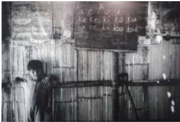
Figure 13. A child photograph while attending the first "school" of the tribe.

Change had been imminent. The tribe started to "evolve". With evolution is the slowly dying culture and tradition of the Taaw't Bato. Nowadays, there is only a reported