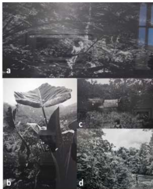
Figure 9. (a) A boy hunts for birds and bats; (b) A child gathering tubers called bancouka; (c) A girl picking fresh vegetables after raining; and (d) A boy trying to catch fish from the river.

In addition to being hunters, the Taaw't Bato tribe are also swidden farmers and the cassavas they eat resulted from the cultivation of their farms. Usually they are described to apply