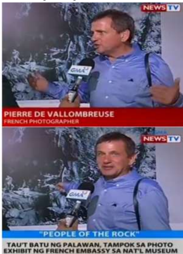
Figure 5. French photographer Pierre de Vallombreuse during an interview on the opening of his photo exhibit at the National Museum.

His artworks showcased the symbolic balance between environment and its inhabitants, the preservation of one’s identity and culture, and the external factors that affect the survival and societal evolution of the group (Vallombreuse, 2017). Last August 31, 2017 up to February 4, 2018, the “The Valley,” a photographic exhibition was open to open for public viewing as a tribute during the 70 th Anniversary of the diplomatic relation between France and the Philippines (The Manila Times, 2017). According to Virgilio S. Almario, Chairman of