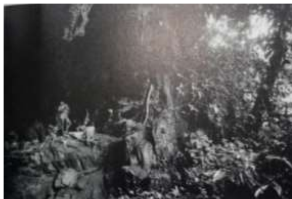
Figure 4. A family prepares to face the monsoon in their cave passed on from generation to generation. (The photo was taken in 1994.)

His artworks showcased the symbolic balance between environment and its inhabitants, the preservation of one’s identity and culture, and the external factors that affect the survival and societal evolution of the group (Vallombreuse, 2017). Last August 31, 2017 up to February 4, 2018, the “The Valley,” a photographic exhibition was open to open for public viewing as a tribute during the 70 th Anniversary of the diplomatic relation between France and the Philippines (The Manila Times, 2017). According to Virgilio S. Almario, Chairman of